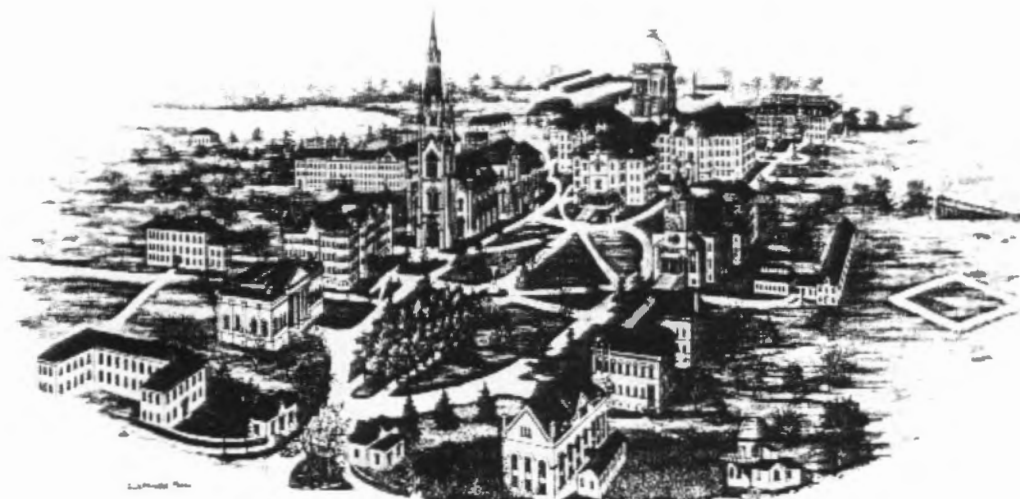
UNIVERSITY OF NOTRE DAME